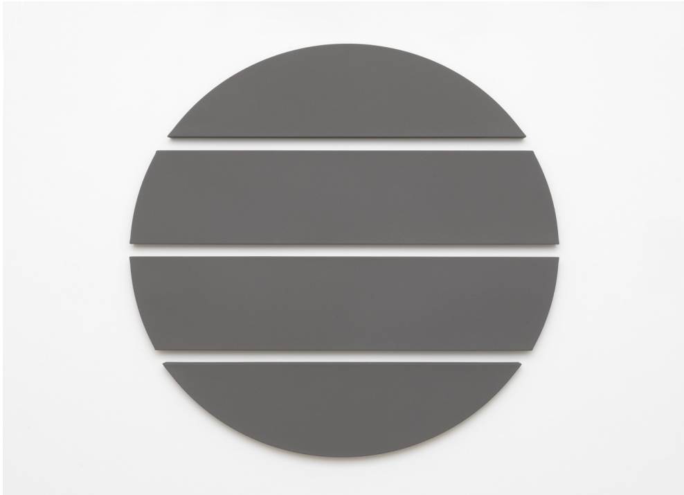
Circle Painting in 4 Parts, 2024, acrylic on canvas, 139.5 cm diameter

"At Art School in 1969, I made a group of paintings. Instead of using stretcher bars I went to the timber yard and chose a standard timber size often used in general joinery work. After being prepared the size is 4.5 cm, this then would be the depth of the paintings. For the colour I chose the paint with a similar approach. Instead of buying paint from an art shop, I went to a hardware shop. Each painting was a single colour; red oxide, brown, green creosote, black, white and grey. Each achieved what I wanted, no illusions, straightforward and urban in feel. The grey painting however went beyond this. Since that time, I have continued to use 4.5 cm as the module and the paintings are always grey. I use these two constant elements to discover different ways of making the paintings." - Alan Charlton.