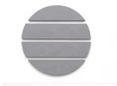
Alan Charlton 1948 Circle Painting in 4 Parts, 2024 acrylic on canvas 103.5 cm diameter