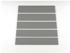
Alan Charlton 1948 Trapezium Painting in 5 Parts, 2023 acrylic on canvas 220.5 x 247 cm