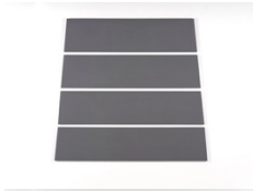
Alan Charlton 1948 Trapezium Painting in 4 Parts, 2023 acrylic on canvas 229.5 x 247.5 cm