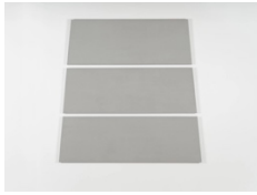
Alan Charlton 1948 Trapezium Painting in 3 Parts, 2023 acrylic on canvas 225 x 225 cm