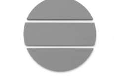
Alan Charlton 1948 Circle Painting in 3 Parts, 2024 acrylic on canvas 103.5 cm