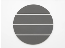
Alan Charlton 1948 Circle Painting in 4 Parts, 2024 acrylic on canvas 139.5 cm diameter