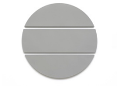
Alan Charlton 1948 Circle Painting in 3 Parts, 2024 acrylic on canvas 144 cm diameter