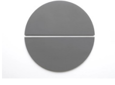
Alan Charlton 1948 Circle painting in 2 Parts, 2024 acrylic on canvas 148.5 cm diameter