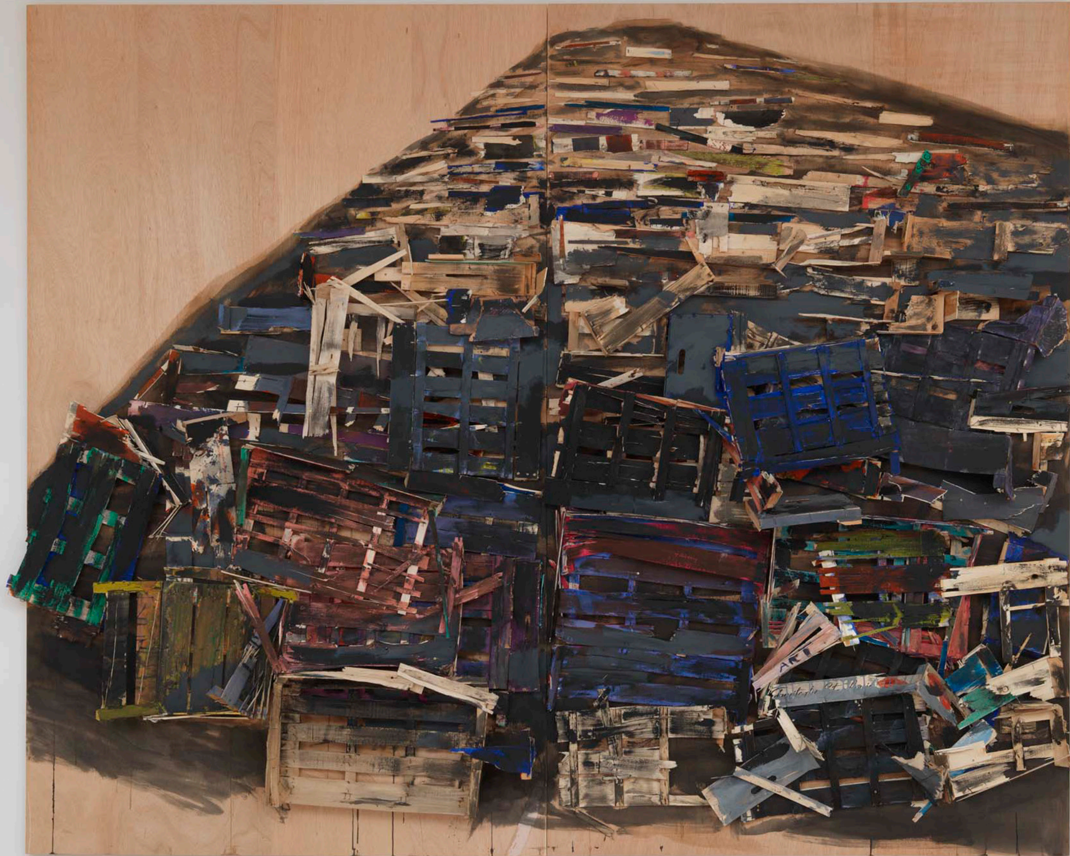
Destruction No. 23 2019 balsa wood and acrylic paint on plywood, 3 parts 250 x 459 x 30 cm overall