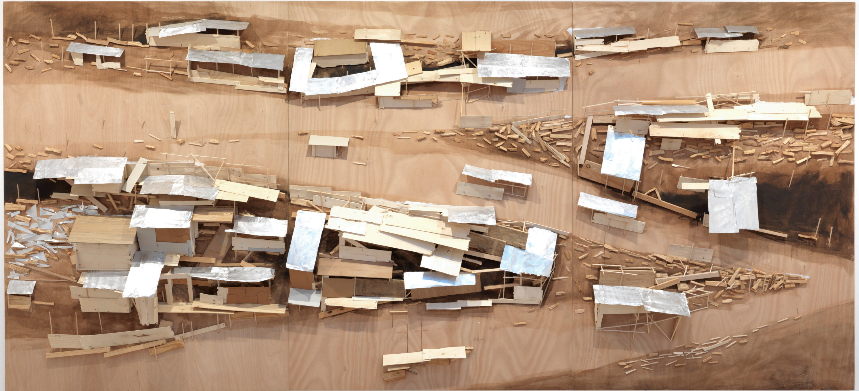
Tsunami No. 2 2015 balsa wood and acrylic paint on plywood 3 parts, 210 x 459 x 12 cm overall