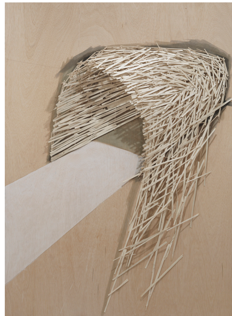
Big Nest Busan No. 8 2018 balsa wood and acrylic paint on plywood 210 x 153 x 8 cm