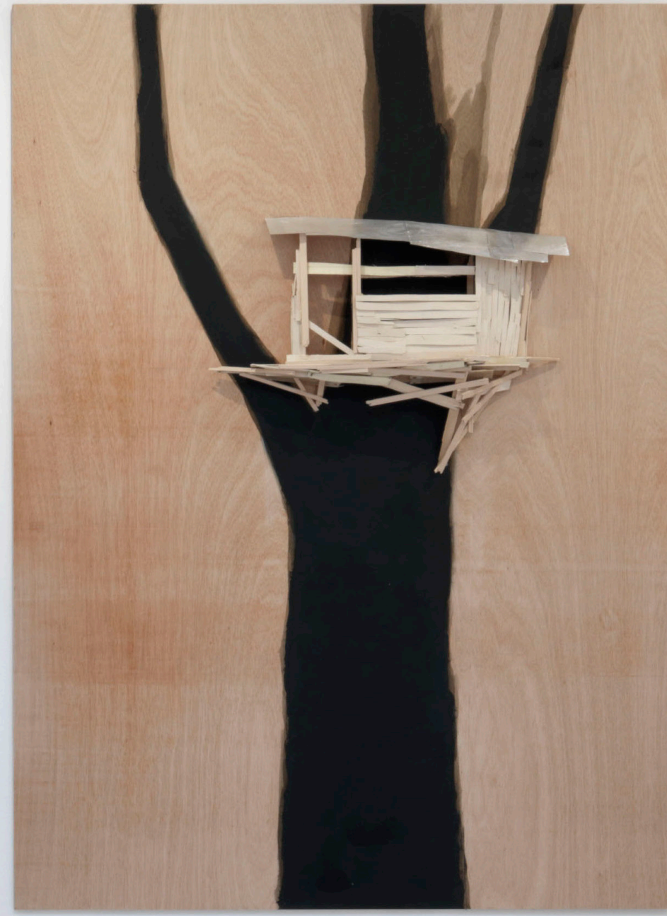
Tree Hut in Tremblay Plan No. 7 2019 balsa wood and acrylic paint on plywood 210 x 153 x 8 cm