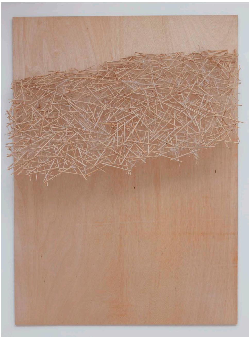
"Nuageux" chateau Malrome No. 1 2019 chopsticks on plywood 210 x 153 x 20 cm