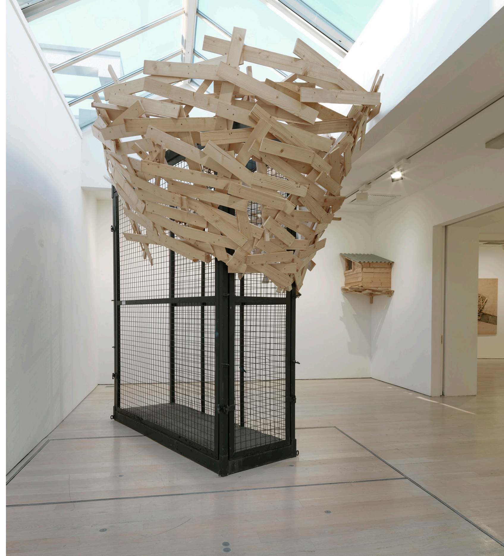
Nest for Annely Juda Fine Art 2019 balsa wood variable size