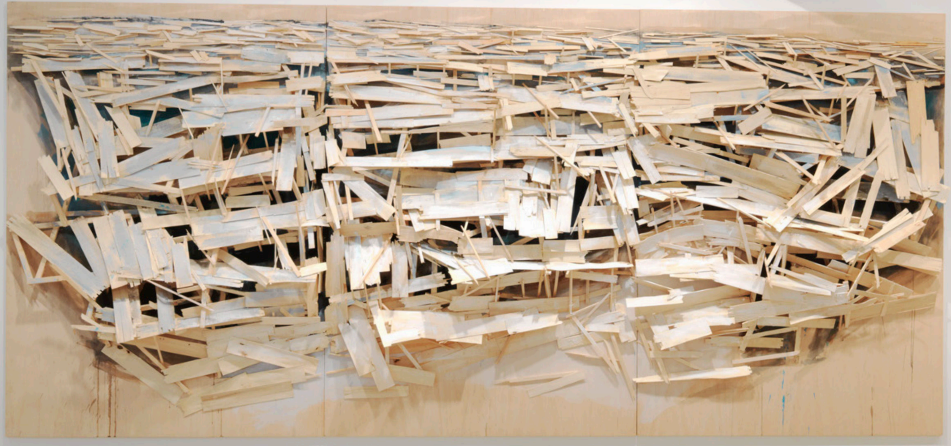
Destruction No. 3 2016 balsa wood and acrylic paint on plywood 3 parts, 210 x 459 x 25 cm overall