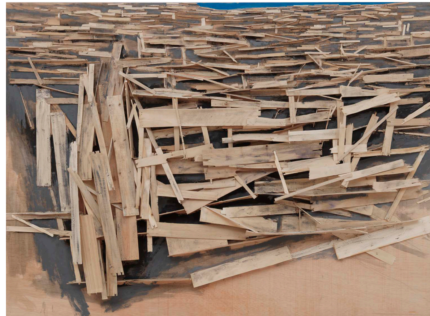
Destruction No. 26 2019 balsa wood and acrylic paint on plywood 153 x 210 x 8 cm