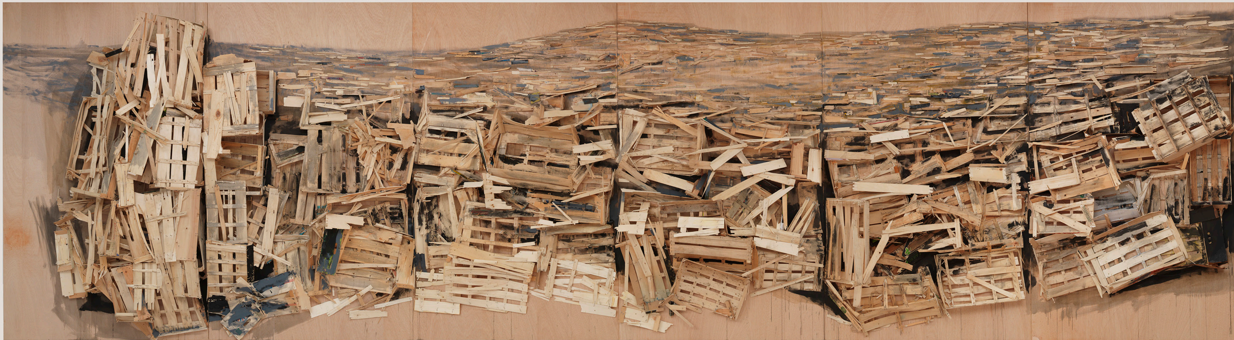
Destruction No. 22 2019 balsa wood and acrylic paint on plywood 6 parts, 250 x 918 x 45 cm overall