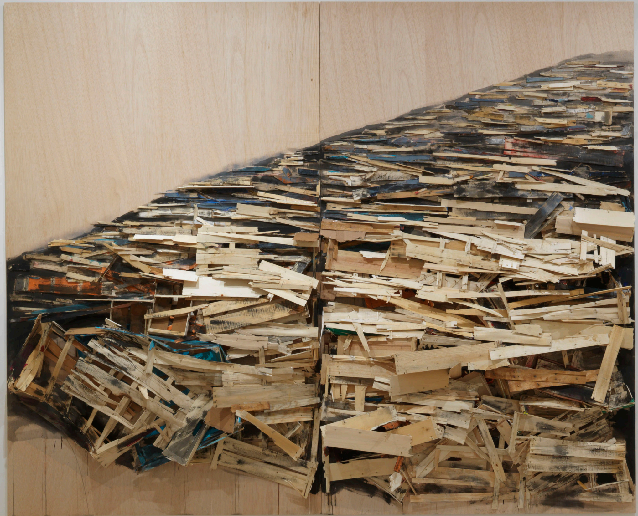
Destruction No. 25 2019 balsa wood and acrylic paint on plywood, 2 parts 250 x 306 x 30 cm overall