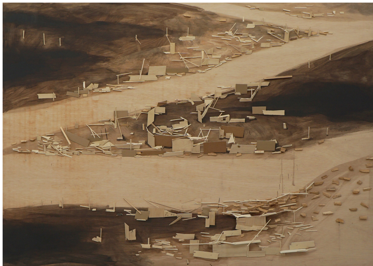
Tsunami No. 2015 balsa wood and acrylic paint on plywood 153 x 210 x 5 cm