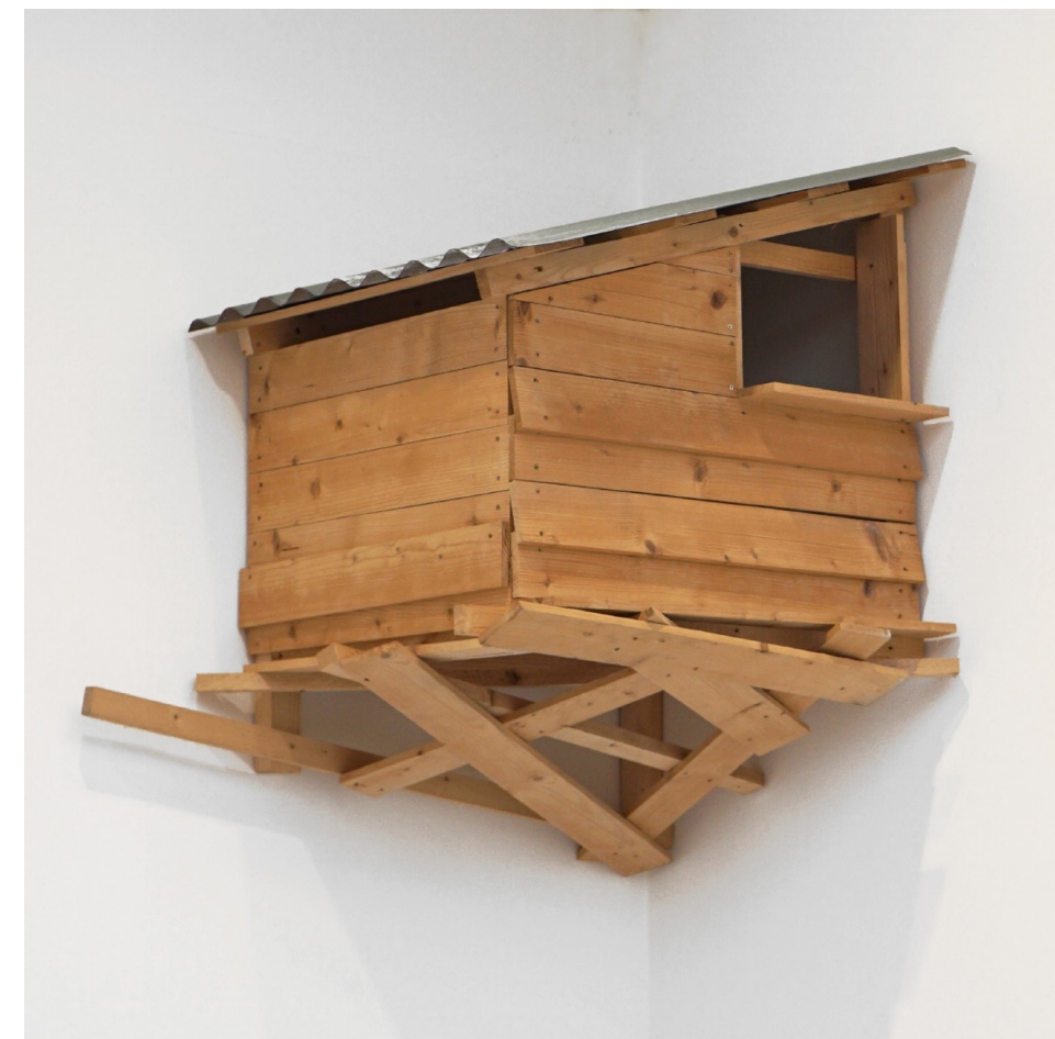
Tree Hut St Denis No 7 2016 balsa wood and metal 105 x 95 x 65 cm