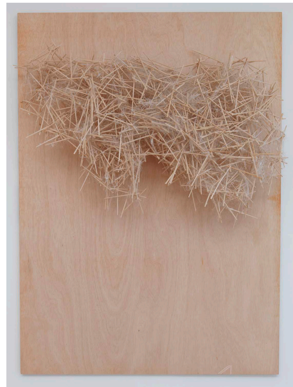
"Nuageux" chateau Malrome No. 3 2019 chopsticks on plywood 210 x 153 x 20 cm