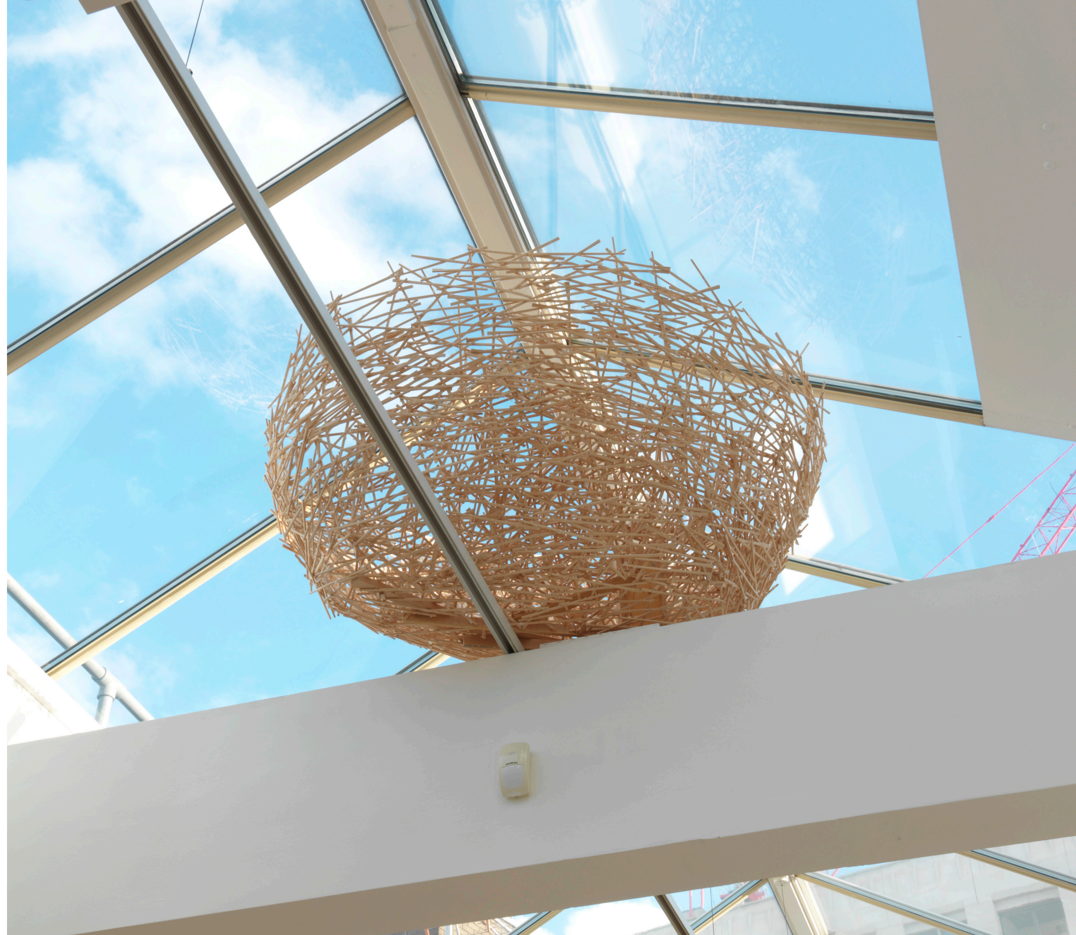
Nest on the Wall No. 3 2018 chopsticks 80 x 65 x 60 cm