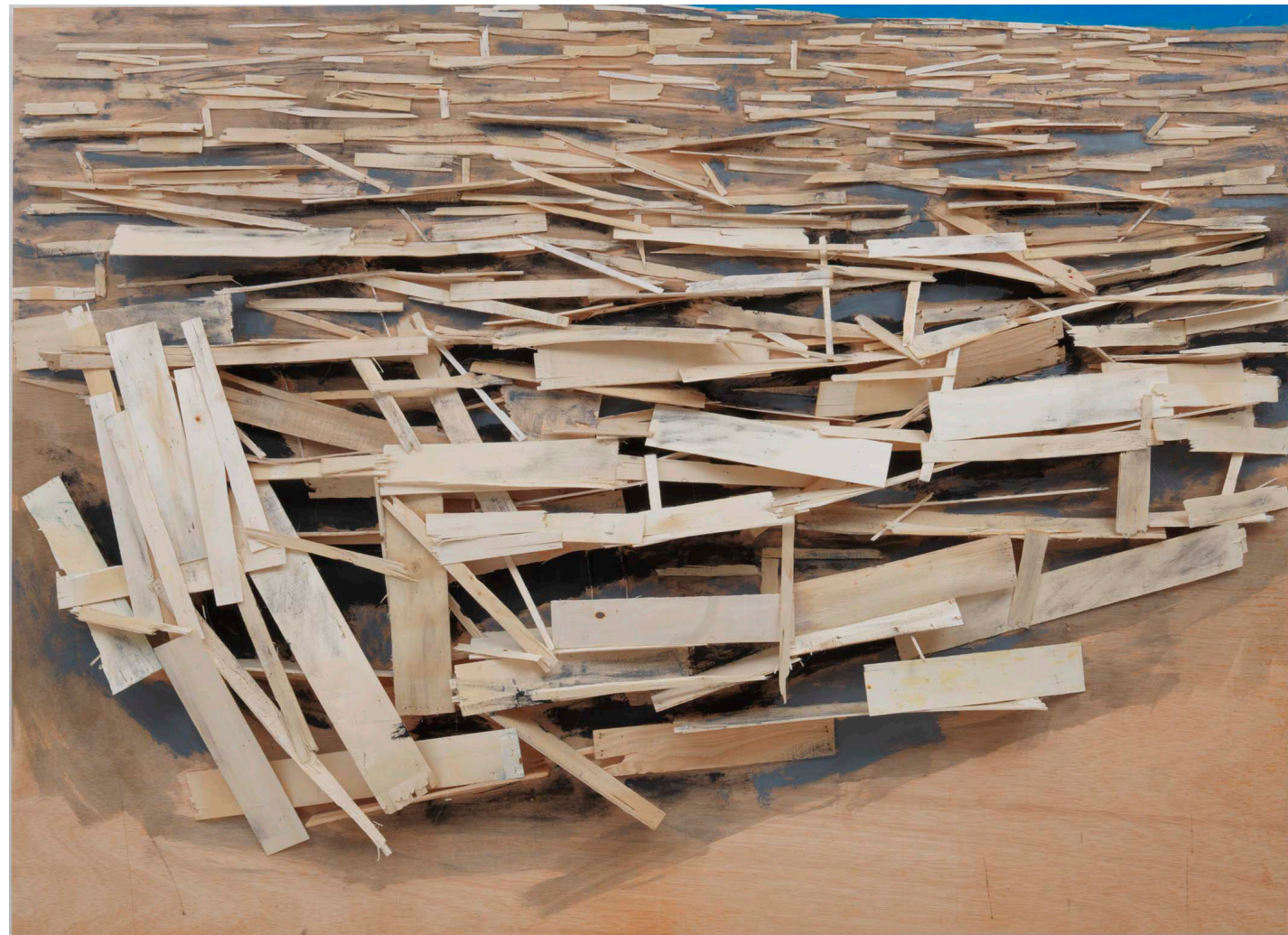
Destruction No. 27 2019 balsa wood and acrylic paint on plywood 153 x 210 x 8 cm