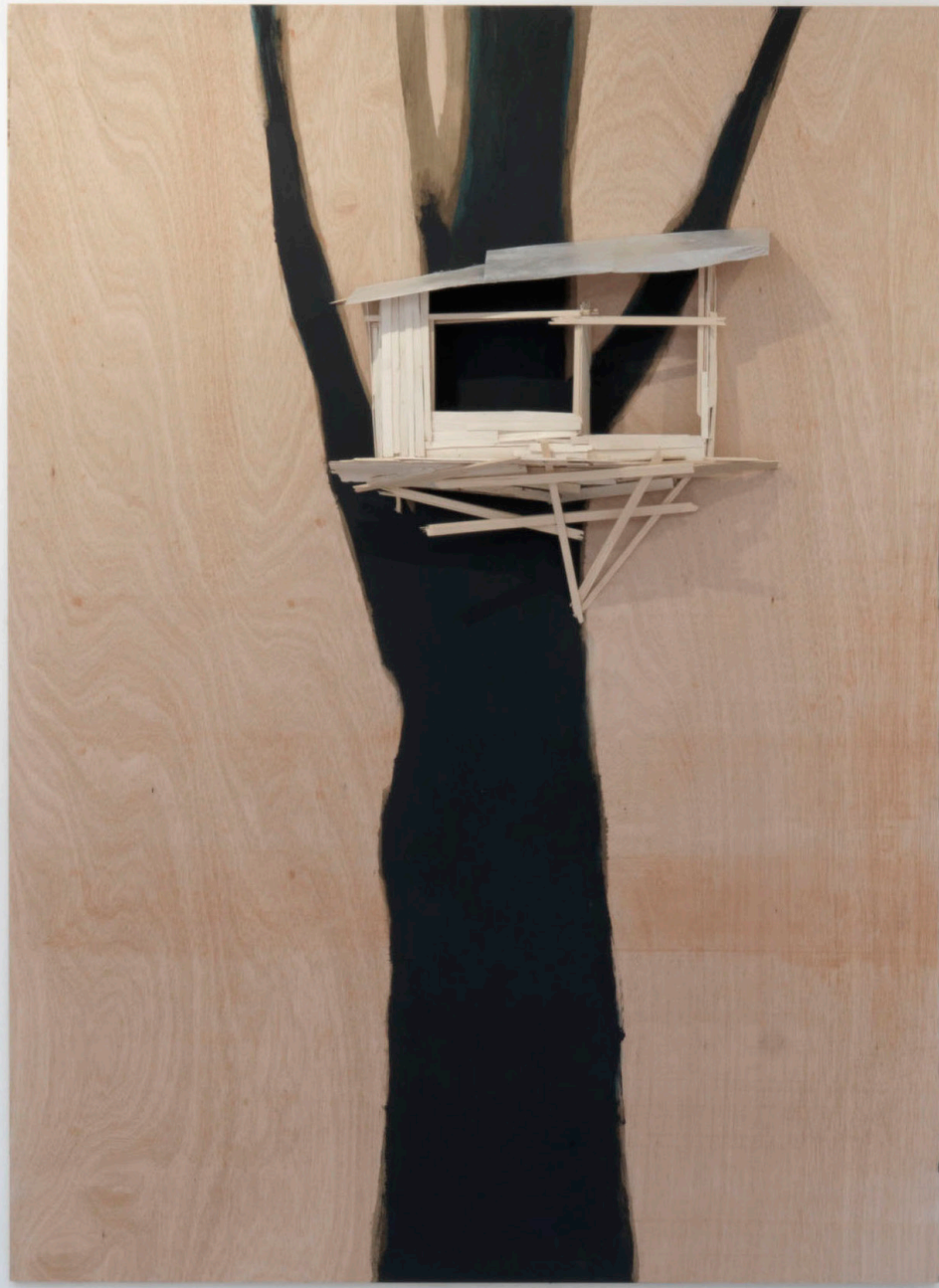
Tree Hut in Tremblay Plan No. 6 2019 balsa wood and acrylic paint on plywood 210 x 153 x 8 cm