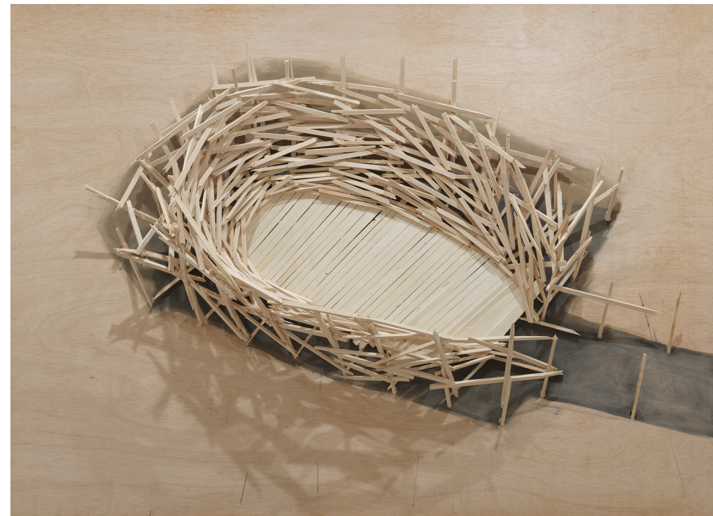
Squatters Project, Kanazawa No. 2 2018 balsa wood and acrylic paint on plywood 153 x 210 x 10 cm