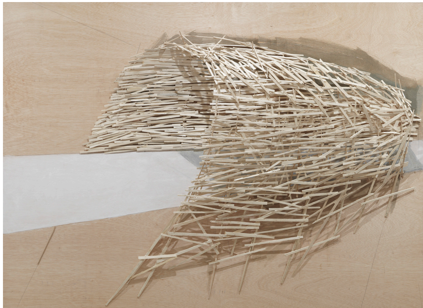
Big Nest Busan No. 6 2018 balsa wood and acrylic paint on plywood 153 x 210 x 8 cm