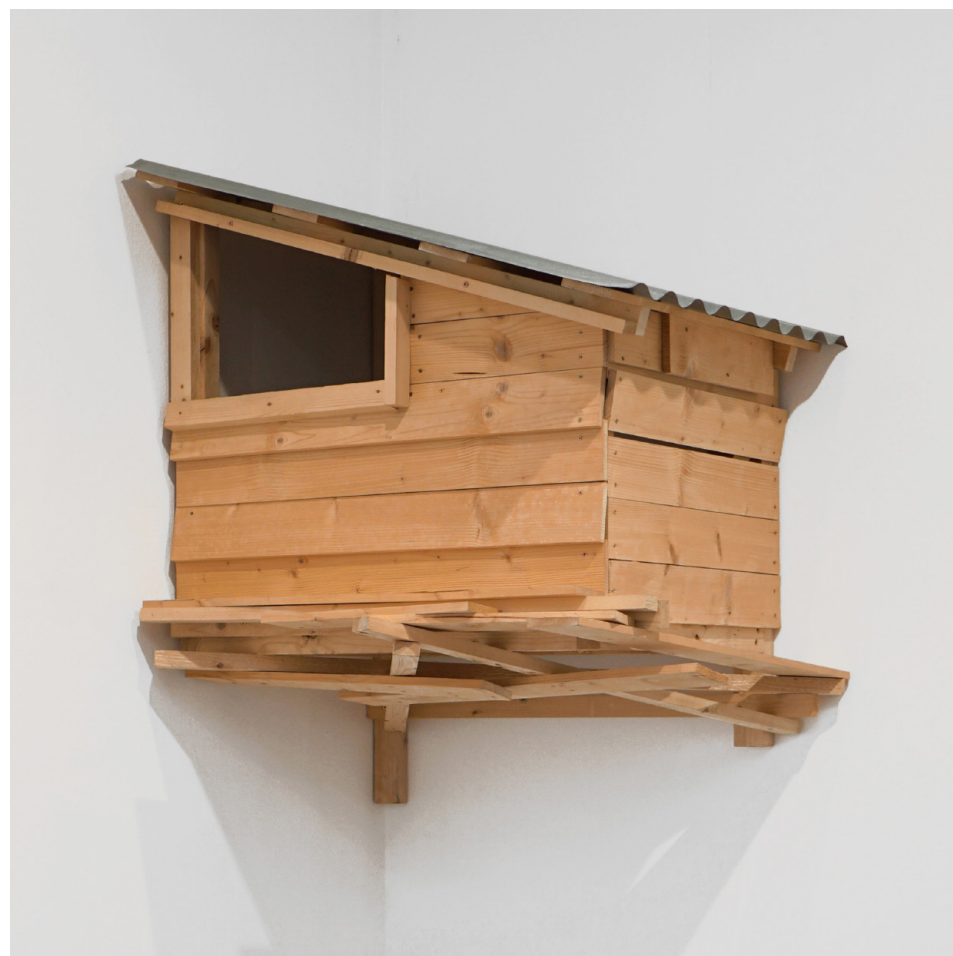
Tree Hut St Denis No 6 2016 balsa wood and metal 85 x 95 x 74 cm